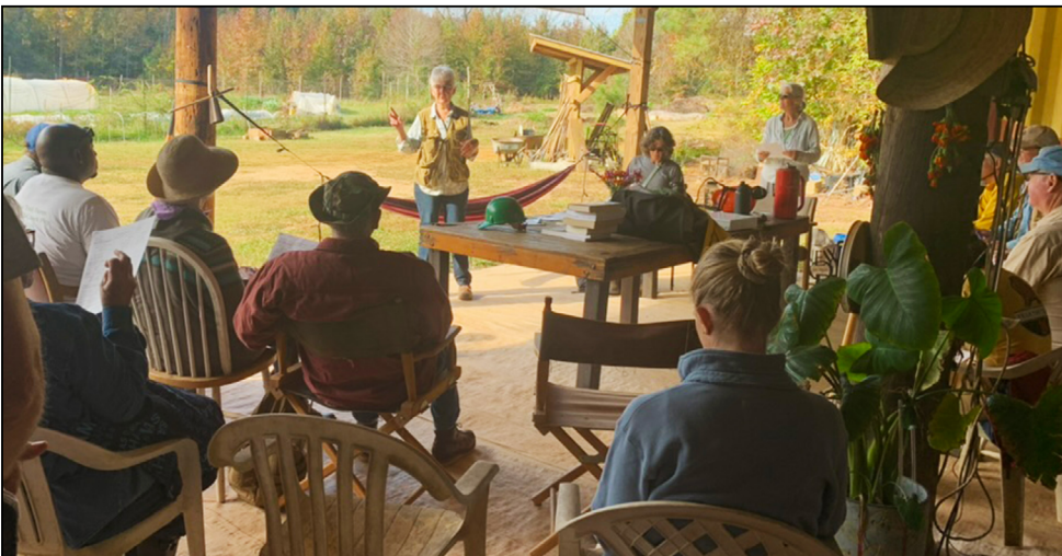
Burn Boss Hope prepares participants for the prescribed burn.